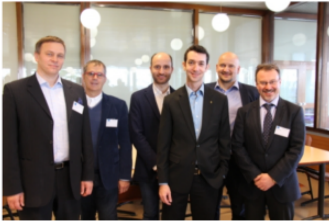
The panel of experts

The event was attended by over 80 participants who had the opportunity to discuss their own business ideas in one-to-one meeting with a panel of experts from a variety of organizations, who also spoke on different topics, strongly related to both innovation and entrepreneurship: commercialization, start-up funding, marketing and social impact.